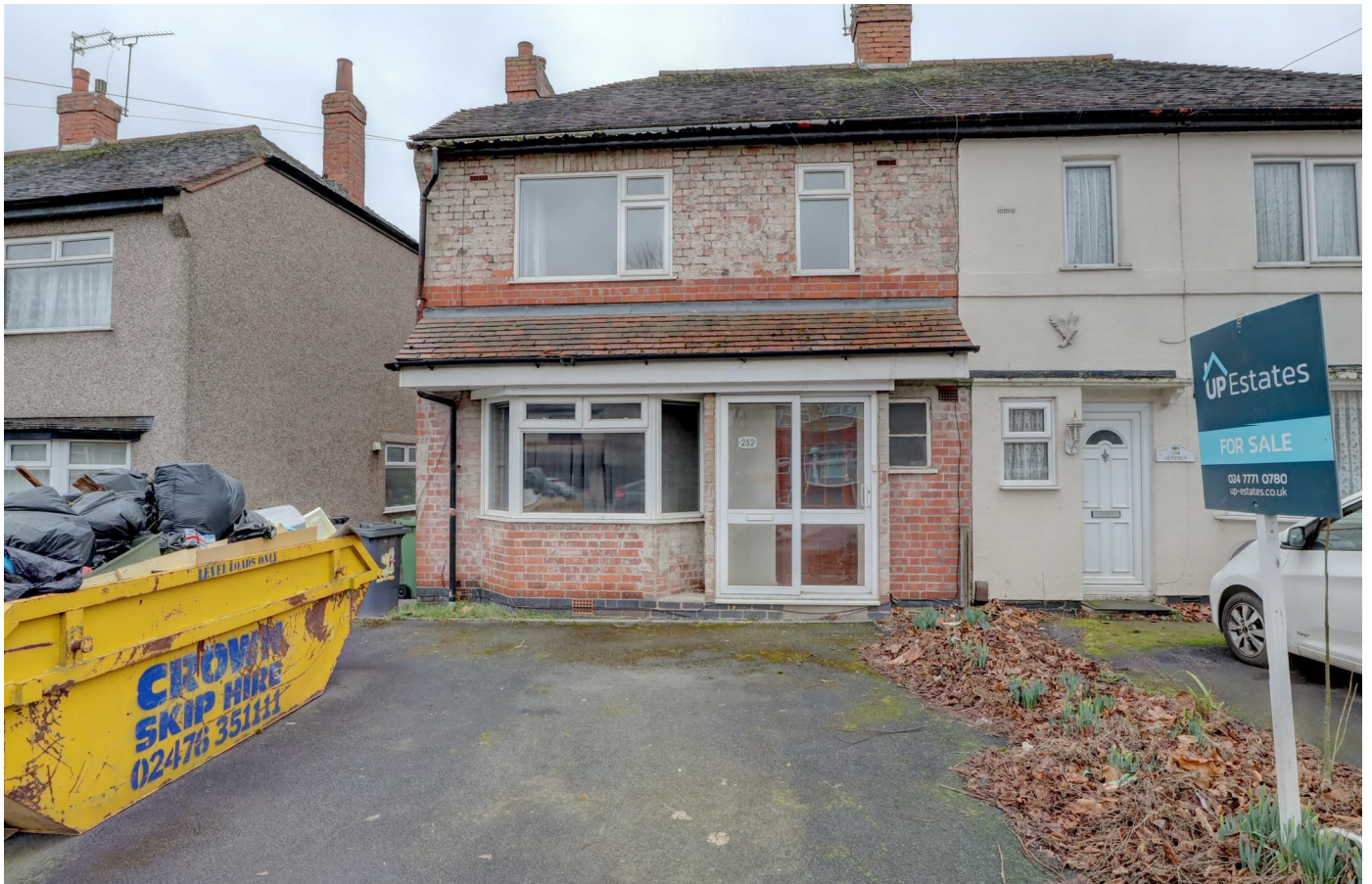
Tomkinson Road, Nuneaton